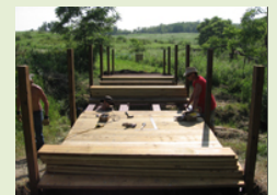
2"x10" Treated Decking