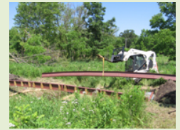
Steel Support Beams