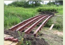
Beams in Place