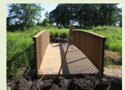
Railing and Spindles Installed