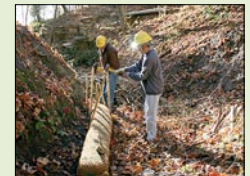
Coir Log Installation