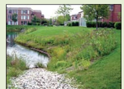
One Year After Installation