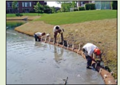
Coir Log Installation