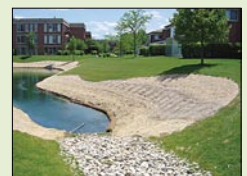
Just After Installation